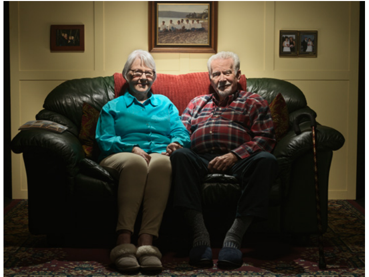
A promotional photo being used as part of our public promotional campaign. This storyline was developed to highlight the work social workers do for and with older adults