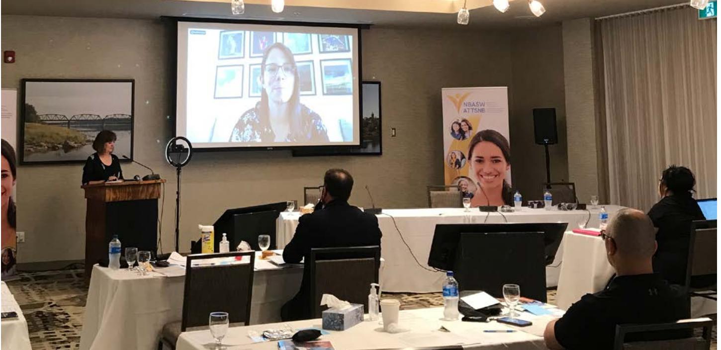
NBASW Annual General Meeting 2020-2021

We would like to thank everyone who joined us on Saturday June 5th, for the NBASW's second virtual Annual General Meeting! For those of you who were unable to join, here's what you missed: