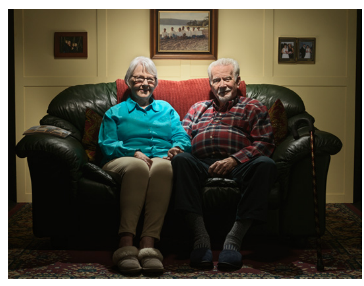
A promotional photo being used as part of our public promotional campaign. This storyline was developed to highlight the work social workers do for and with older adults

As you may be aware, we began the campaign on social media in 2020 and continued it through 2021. In 2021 we asked you, our members, to share stories and experiences you've had. We then worked with m5 to anonymize and adapt those stories to help reach our